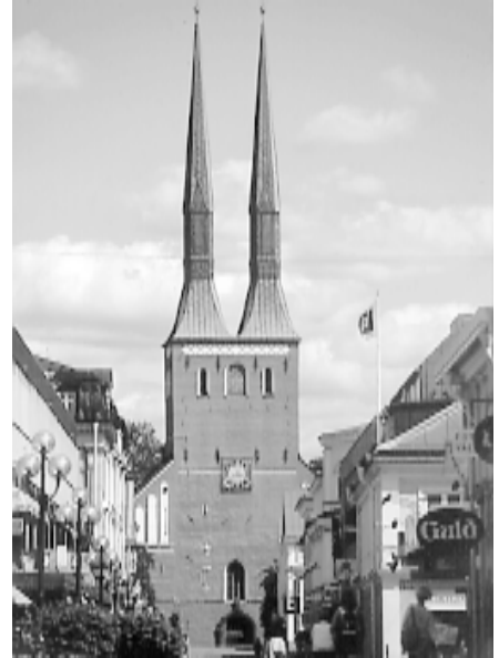
Växjö Cathedral dating from the 12th century and totally renovated in 1995.