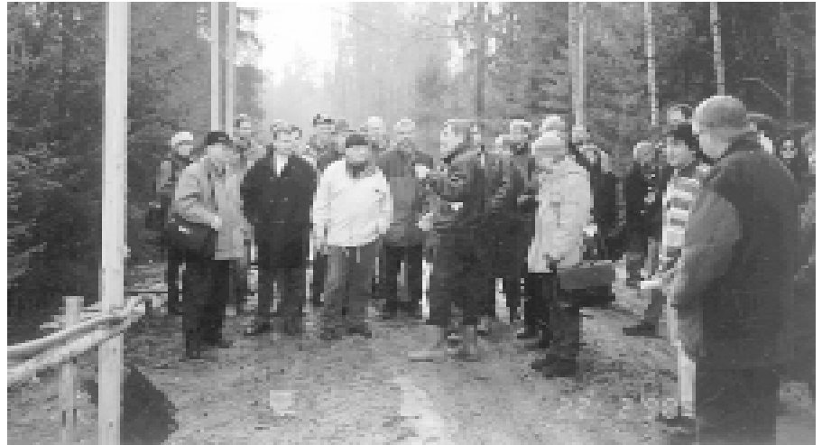
Participants on an excursion to the Valciunai oil terminal.

programme, which started with a brief introduction to common remediation methods and their costs. The methods presented after that were containment and stabilisation methods, thermal cleaning methods, use of air for cleaning contaminated sites, phytoremediation as well as in-site and off-site bioremediation. The participants were pleased to hear that there are many different solutions to solve the problem with contaminated soils. However, there is still much work to do in this field. On the third and last day of the seminar the participants visited the former military fuel storage Valciunai, which is a contaminated site south of Vilnius.