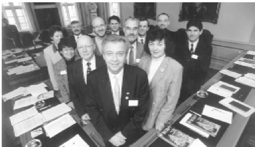
The UBC Board discussed perspectives upon commencing their work on the new UBC strategy.