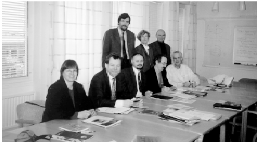
UBC Local Agenda 21 being discussed in Nacka.

The participants discussed also how Local Agenda 21 could be integrated into