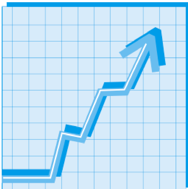
The Baltic Sea Region trade. The only way is UP!

Šiauliai Chamber of Commerce Industry and Handicrafts Rūdės 17 5400 Šiauliai, Lithuania Tel. +370 1 427709 Fax +370 1 439973 E-mail: siauliai_cci@siauliai.omnitel.net