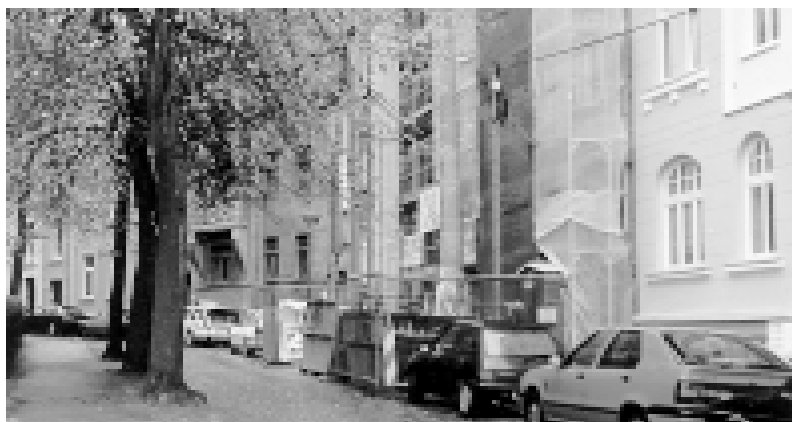
View over the URBAN-funded quarter in Rostock.