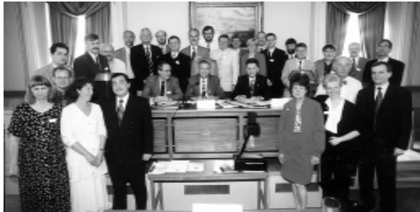
These are the persons behind the decisions made in Bergen.

The President introduced possible subjects of the workshops to be carried out during the conference. The aim