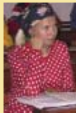
Information & Education